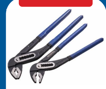
Faithfull Waterpump Plier Twin Pack XMS24