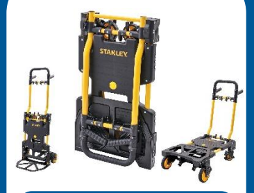
Stanley 2 in 1 Folding Hand Truck/Trolley XMS24