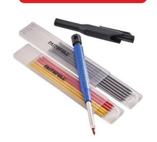
Faithfull Automatic Pencil & Lead Set XMS24