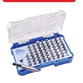
Faithfull 61 Piece Chrome Vanadium Security Screwdriver Bit Set XMS24