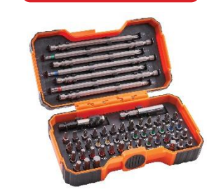
Bahco 54 Piece Colour Coded Bit Set XMS24