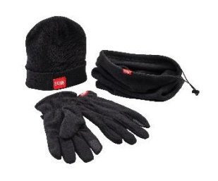
Scan 3 Piece Winter Essentials Pack Hat, Gloves & Snood XMS24