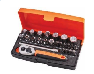
Bahco 25pc 1/4 Drive Socket Set XMS24