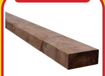
£21.00 / ea

Brown UC4 Treated Sawn Sleeper 100 x 200mm x 2.4m