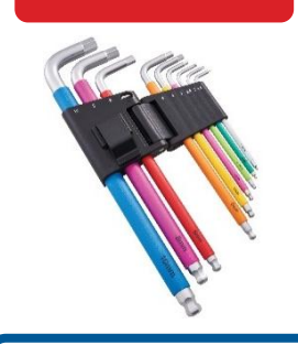
Faithfull 9 Piece Colour Coded Hex Key Set XMS24