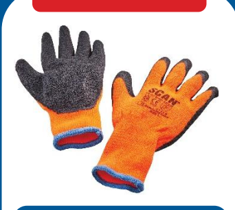
Scan Dipped Thermal Latex Gloves (3 Pairs) XMS24