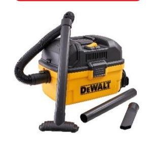
Dewalt 15L Wet & Dry Toolbox Vacuum XMS24